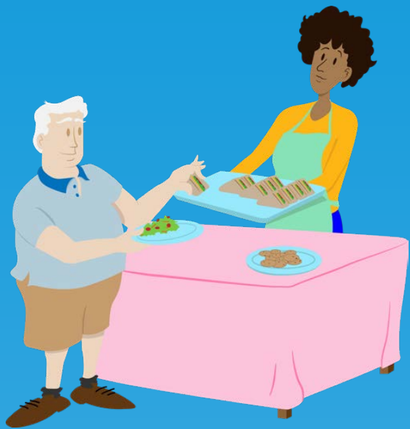
Meal Site Visits

Vermont Foodbank's goal is to get nourishing food to our neighbors across the state. Most food goes from the Foodbank to partners who directly serve their communities via food shelves, meal sites, and home delivery.