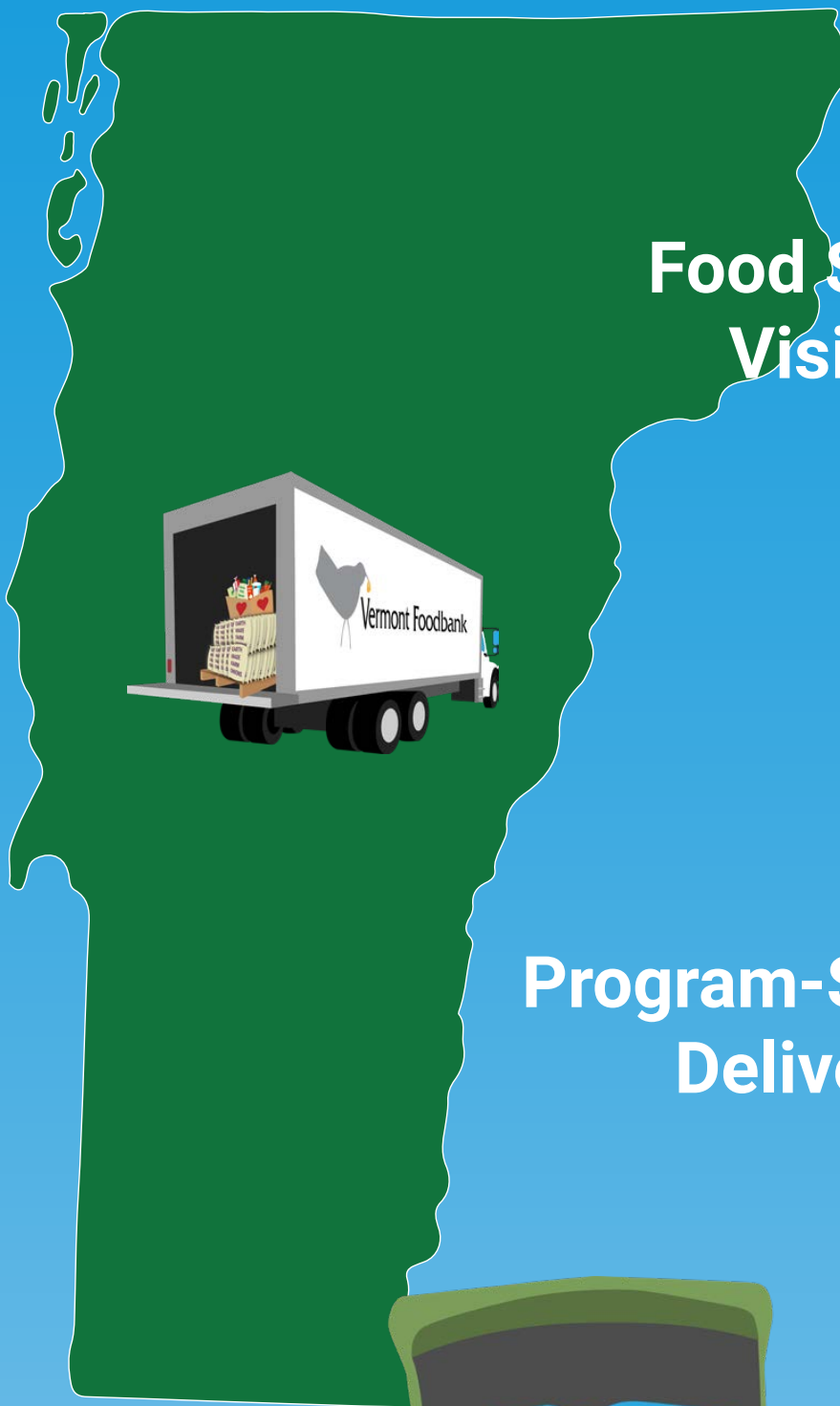
Food Shelf Visits